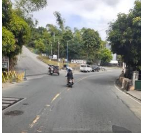
/ Entrance of Cardona