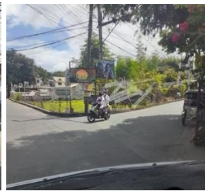
/ Turning right to San Juan st /