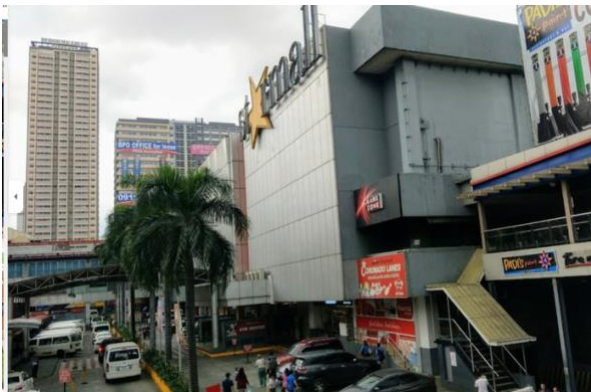
<Starmall on EDSA/Shaw>