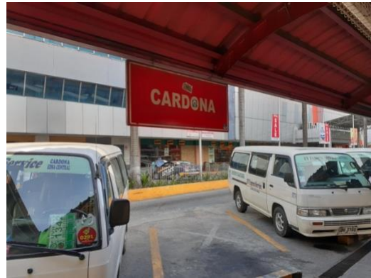
< UV express van terminal>