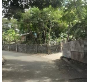
/ Right turn going up take off