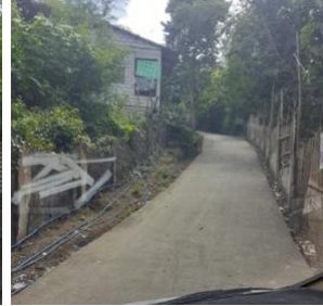
/ Steep concrete road /