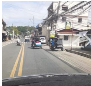
/ right turn in front of Alfa- mart