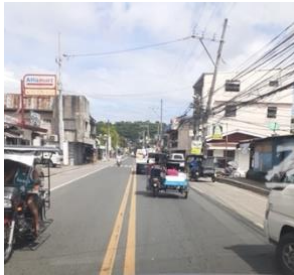
/ In front of Alfa-mart