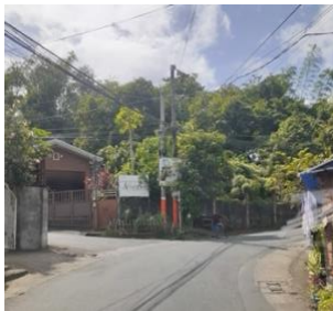
/ Turning left to Capistrano st